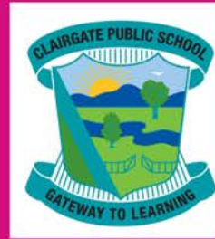
Clairgate Public School