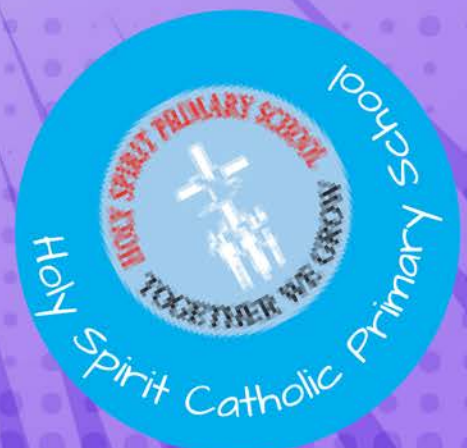
Holy Spirit Catholic Primary School